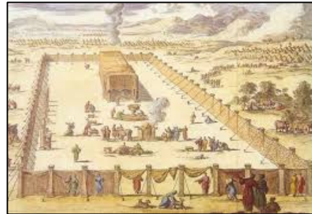
The Witness of Heaven on Earth