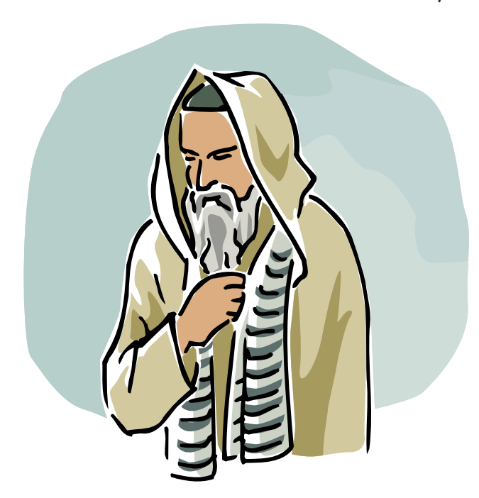
Yom Kipur is a time to humble oneself before YHVH.

What does it mean to "afflict/humble your souls"? This is a Hebraic or biblical expression